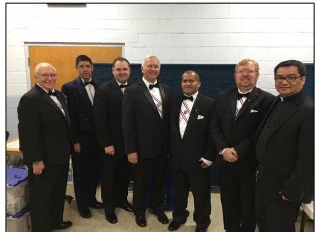
New Assembly 2430 Sir Knights at the Fourth Degree Exemplification – April 18, 2015 in Virginia Beach